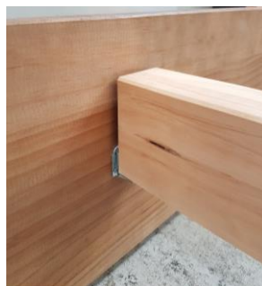
Centre Rail in place