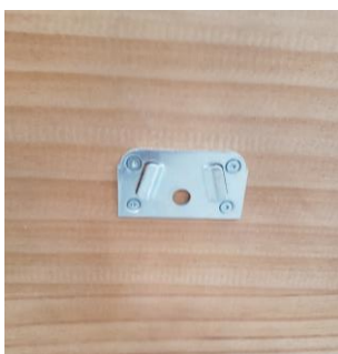
Centre Rail Bracket