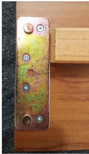
Bracket on Side Rails