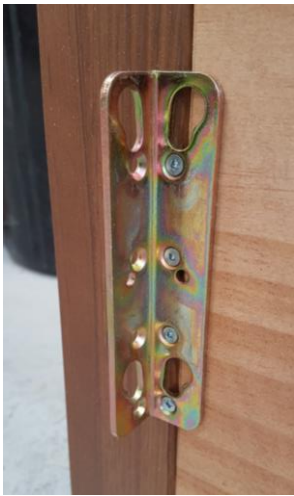
Bracket on Headboard and Tail Board