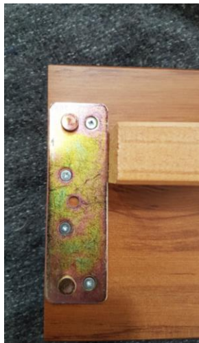
Bracket on Side Rails